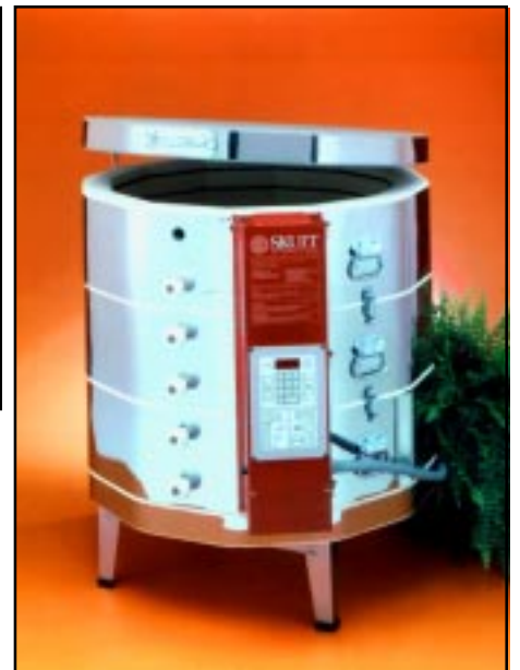
The Production Workhorse. KM-1227-3